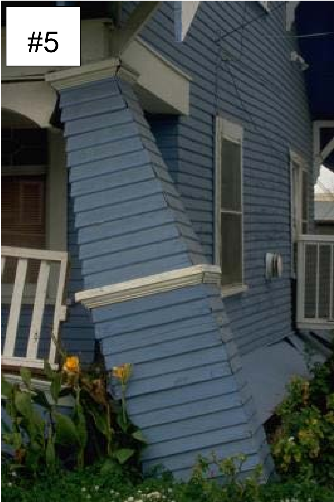
Sizeup Photo #5