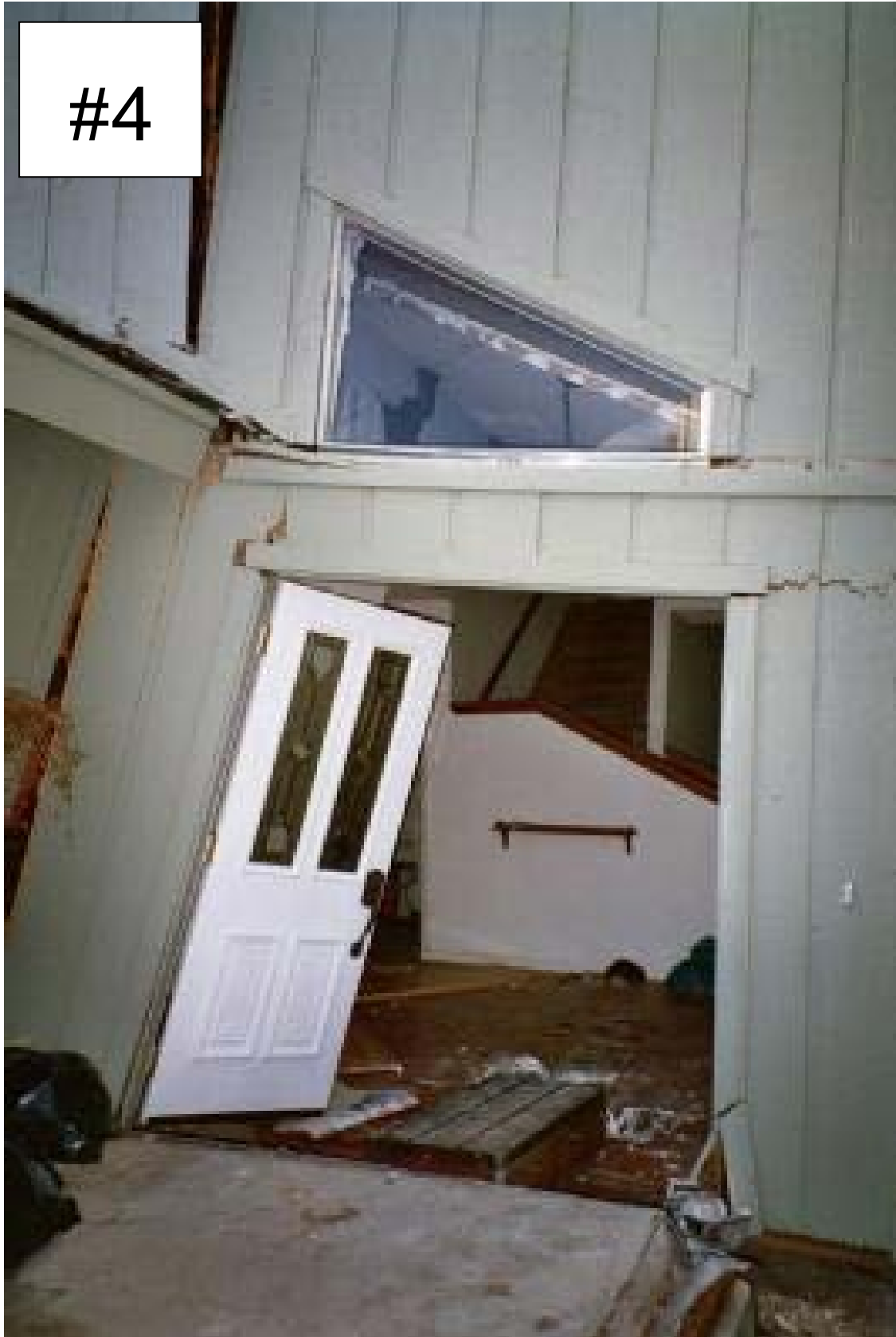
Sizeup Photo #4