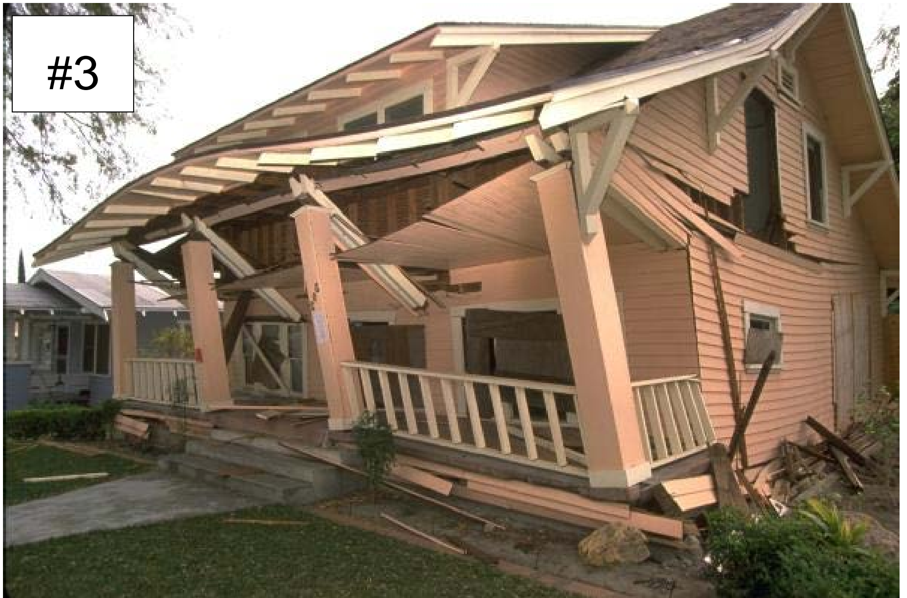
Sizeup Photo #3