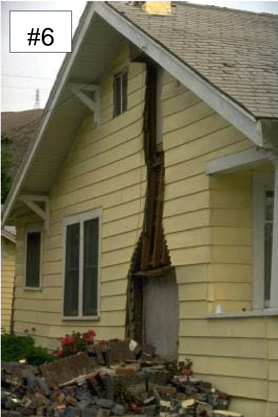
Sizeup Photo #6