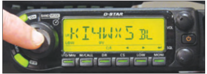
Figure 3 — Here I'm programming the ID-880H. Note the little arrows at the bottom of the display that aid navigation. Also note that the display shows eight characters (with the last two shrunk a bit). This call sign: KI4WXSBL is DPlus shorthand that says "link to the KI4WXS UHF repeater."

DPlus and DV Dongle users won't hear you! This convention, according to ICOM, is per the D-STAR standard.