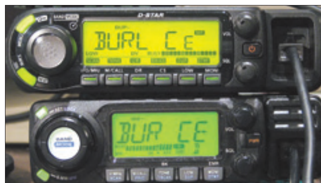
Figure 1 — Compare the ID-880H display with the older ID-800H below. The '880H is wider, a bit more cluttered, but still easy to read. The '880H display can show eight characters compared to the ID-800H's six. The ID-880H has one extra button, but the button labels are printed on the panel and disappear in the dark. The bottom row of icons shows the button's secondary (push and hold) functions.

Price and features will make the ICOM ID-880H a popular VHF/UHF dual band mobile radio with D-STAR digital and analog FM capability built in.