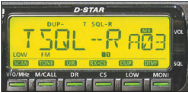
Figure 2 — Selecting a tone mode in the ID-880H. The tone options shows up as big characters, not just tiny icons. This is the new reverse tone squelch mode described in the text.